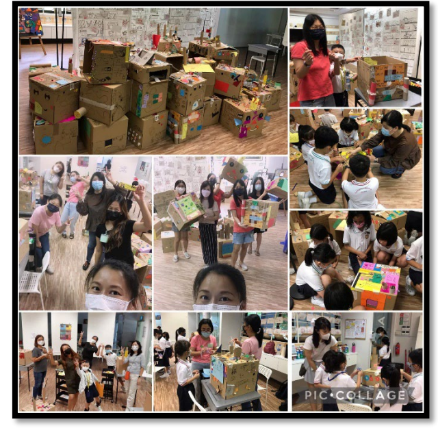
Recess - Science Activity (July to Sept)